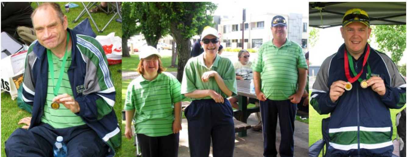
Tri State Games | Horsham 2015