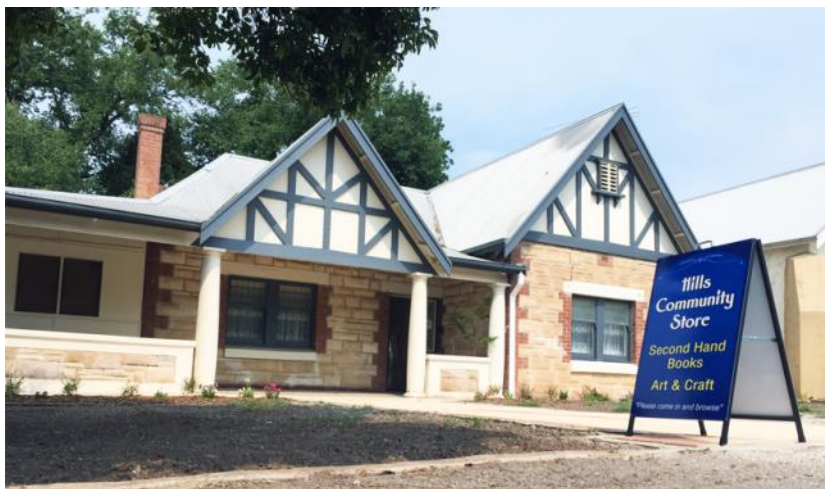
The Hills Community Store | 38 Hutchinson St, Mt Barker SA

HCO's latest expansion of Day Option's programs, the Hills Community Store at 38 Hutchinson Street, has been open for about three weeks and we are seeing a steady increase in customers and sales. It has been a very low key opening in an effort to ensure we have the retail side of the business working prior to clients coming on site in the New Year. Having received positive feedback from our customers about what HCO is doing leads us to believe we are on the right track and that we have strong community support.