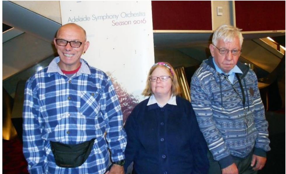
Adelaide Festival Theatre | Regular Theatre Goers

“An inclusive community that actively acknowledges and values the intrinsic worth and contribution of persons with an intellectual disability”